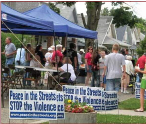
Berries & cream block party sponsored by Tuxedo Park Baptist Church